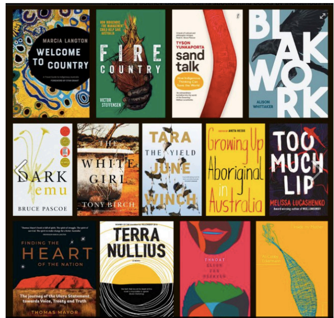
Most popular posts on social media in 2020

Writers SA continued to broaden our reach, sharing our workshops, initiatives, and content, engaging with new and established audiences through our own site, social media, and e-news; as well as gaining positive coverage from local and national media in 2020.