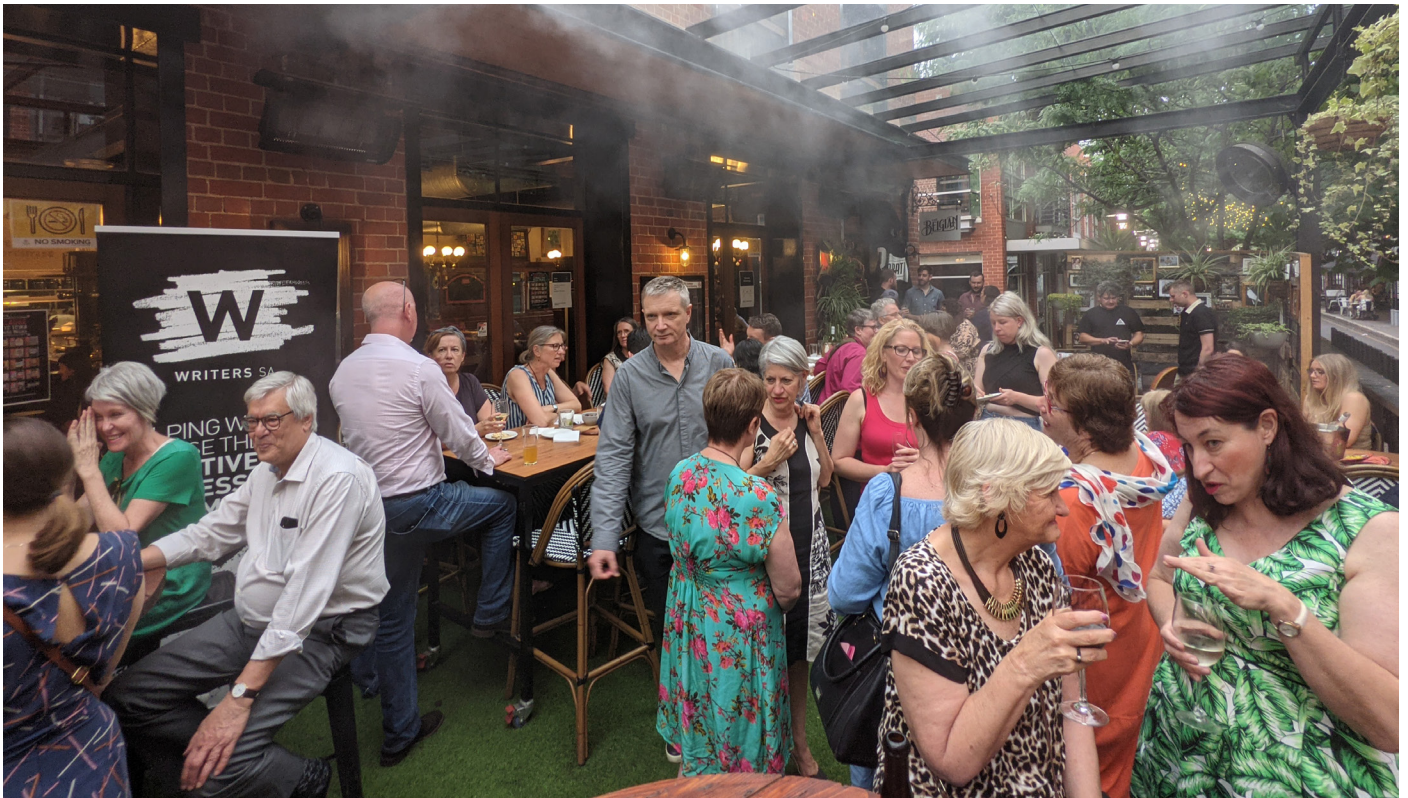
2020 end of year event at the Belgian Beer Cafe

Mentorships: The Writers SA mentorship program is designed to connect our members with a suitable, formal mentor, at any stage of their writing careers. From writing craft, editing, pre-publication, to marketing and publicity mentorships – and encompassing a wide range of genres – Writers SA assists early-career writers to find the mentor to guide their creativity to the next level.