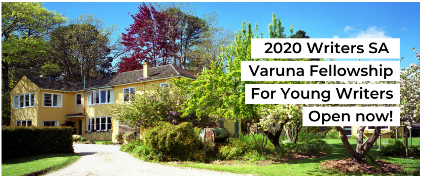
Varuna residency collateral