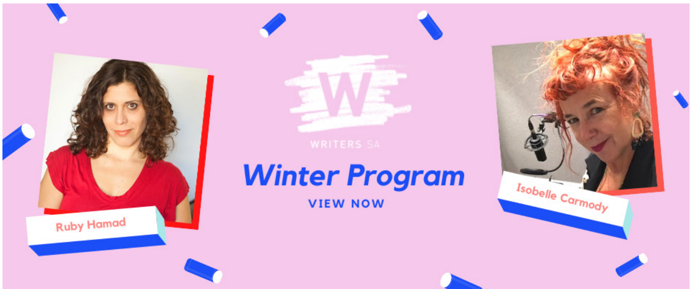
Winter program launch collateral