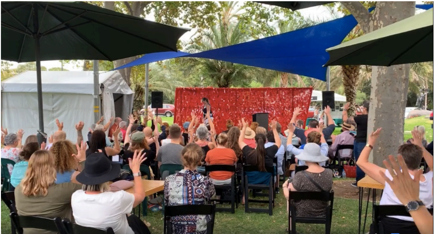
Deaf Storyteller's event at Adelaide Writers' Week